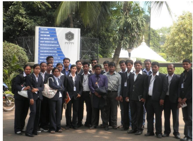
Visit at Sanjay Ghodawat Group