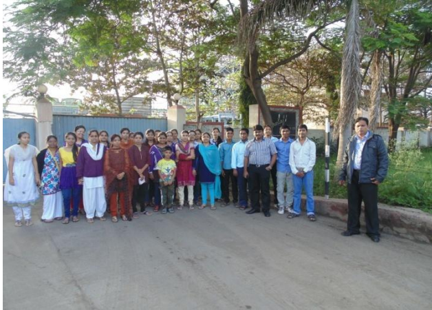
Visit at Balaji Amines

AKIMSS institute visits different organizations in each year. Our students are visited to various companies; they study the methods of producing the products, the methodology they uses. The TQM is analyzed and studied by our student.