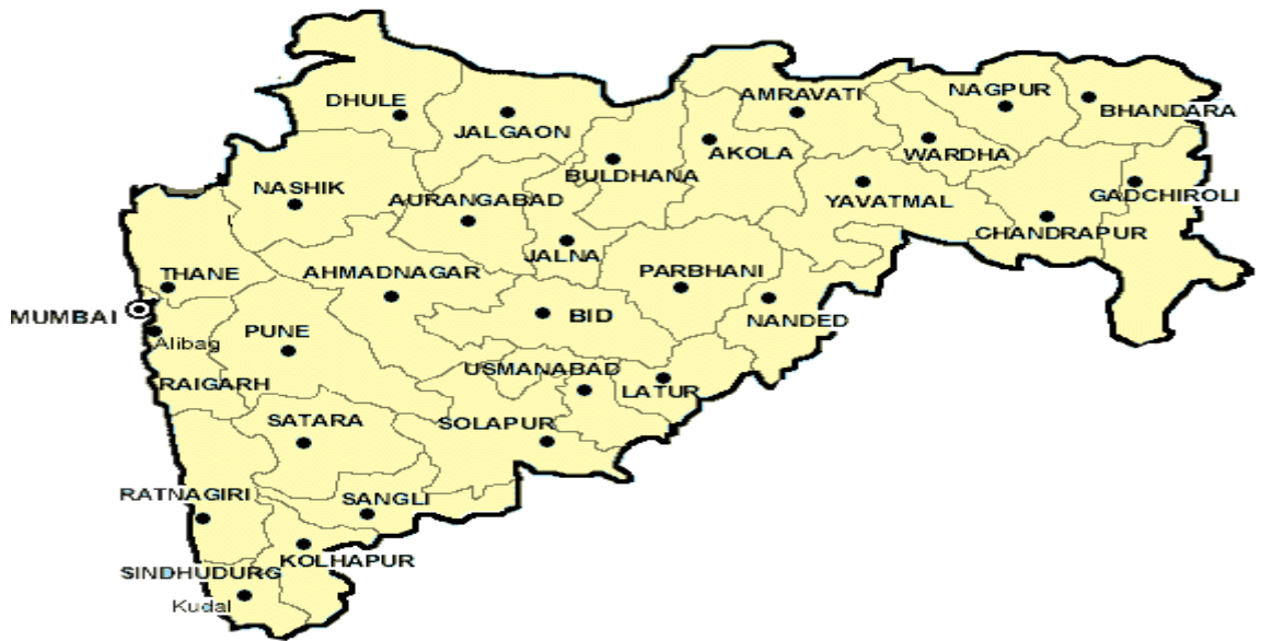
MAP:- III no-1 Maharashtra state Map

Maharashtra is prime educational destination of the well known universities. The universities in Maharashtra are helping to enhance the education excellence. There are many universities in Maharashtra that truly provides high quality education for every one aside from multi cultural zeal and their qualified faculties, the university in Maharashtra are not only producing quality research operations. The head of all the universities is the Governor itself and concern with deemed university founder is the chancellor of the university.